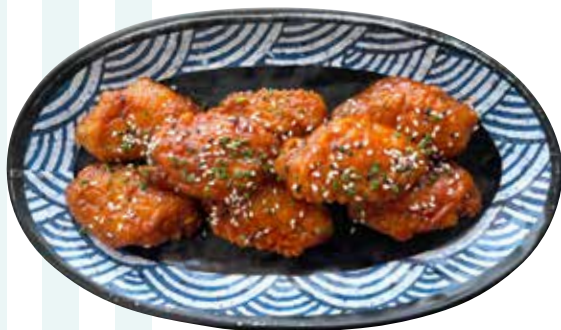
KFC WINGS: KOREAN FRIED CHICKEN