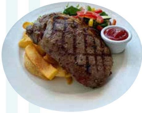
PRIME RIBEYE STEAK