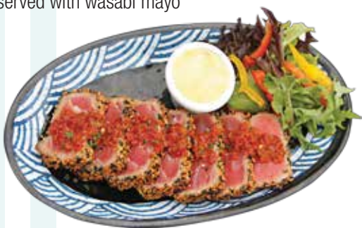
SEASAME-CRUSTED TUNA CHUNKS

fresh tuna coated in japanese miso and black & white sesame seeds & served with wasabi mayo