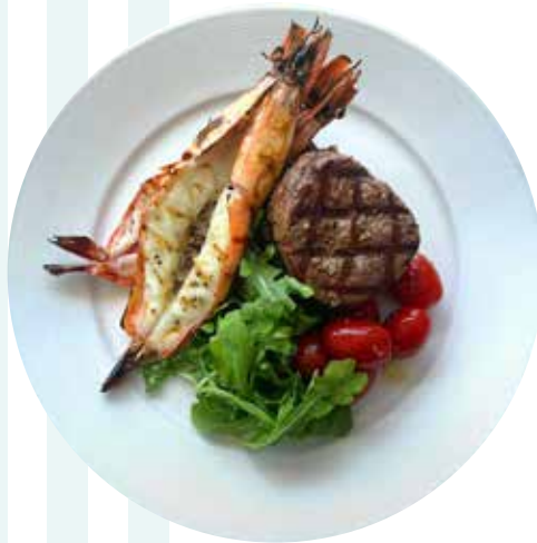
SURF & TURF

Sauteed Mushroom, Creamed Spinach, Garden Salad, Steamed Rice, Fat Chips, Potato Wedges