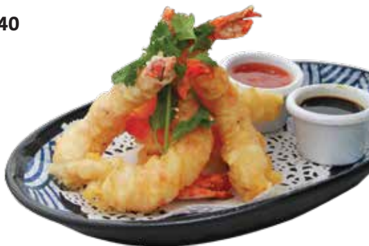
TEMPURA PRAWN & CHILI SAUCE

lightly coated in tempura batter and fried served with sweet chili and wasabi soy dipping sauce