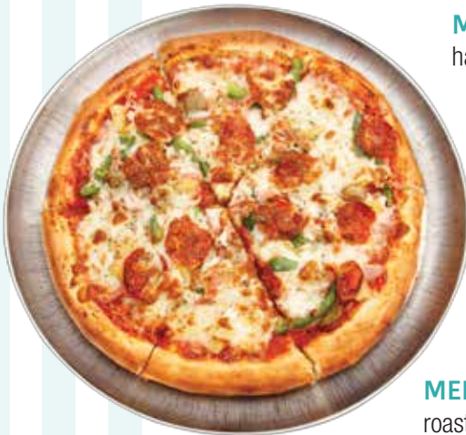
ZAKS HOUSE SPECIAL