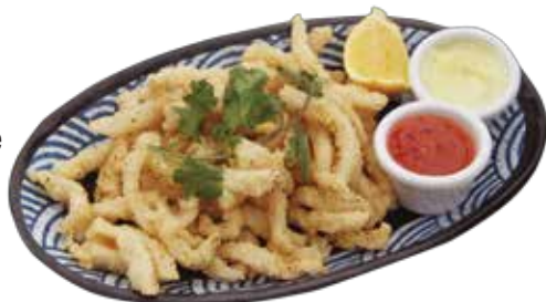
SALT & PEPPER CALAMARI

deep fried fresh calamari in a light batter infused with flaked sea salt with a lemon pepper seasoning