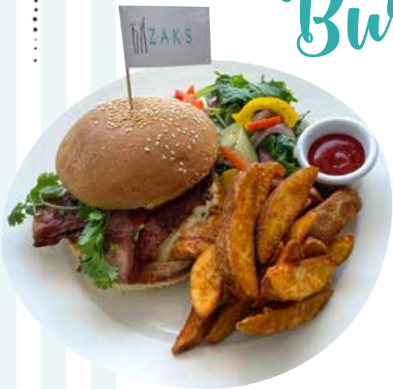
TEQUILA CHICKEN BURGER