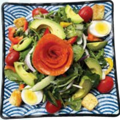
COB SALAD WITH SMOKE SALMON